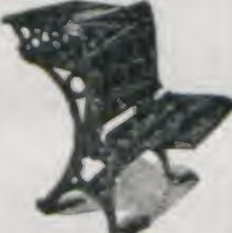
KEY NOTE SCHOOL DESKS